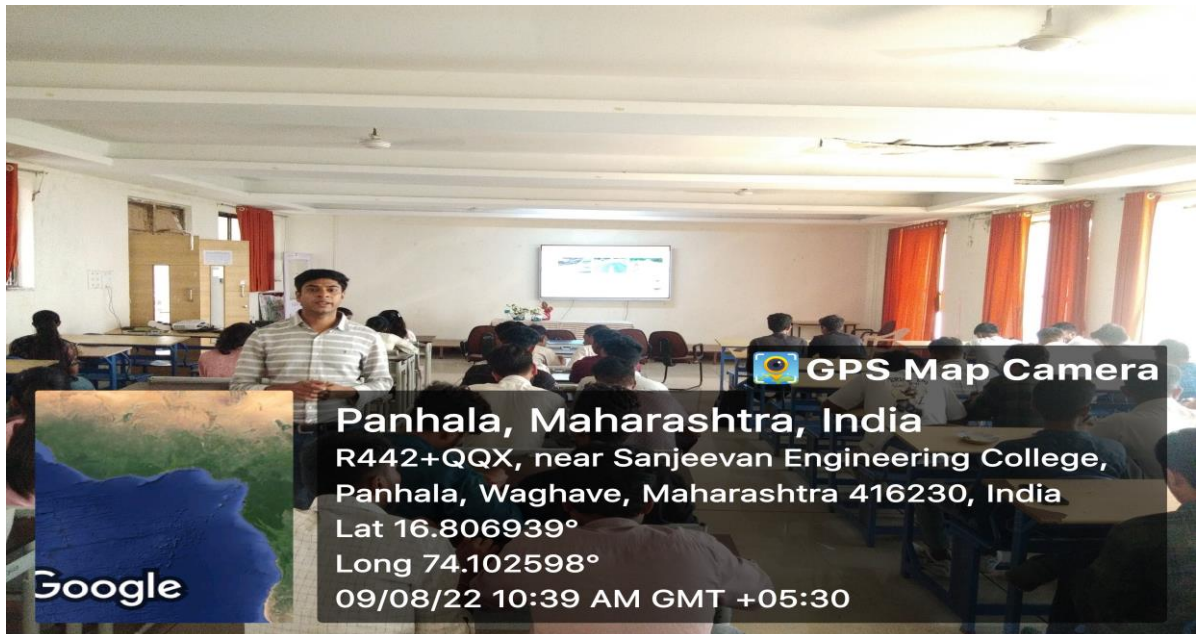
2. Prof. D.V.Patl Interacting with students