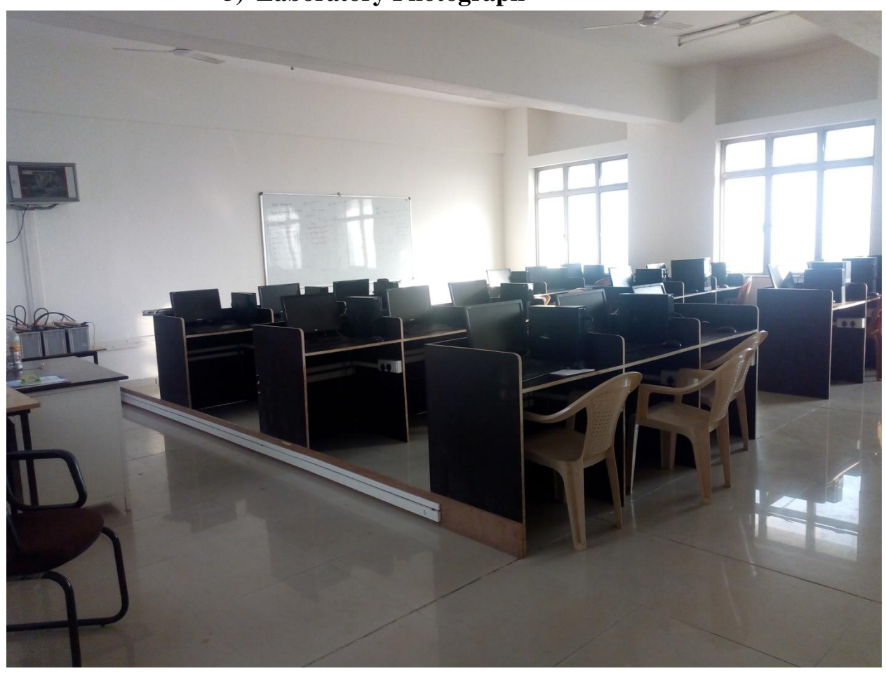
5) Laboratory Photograph