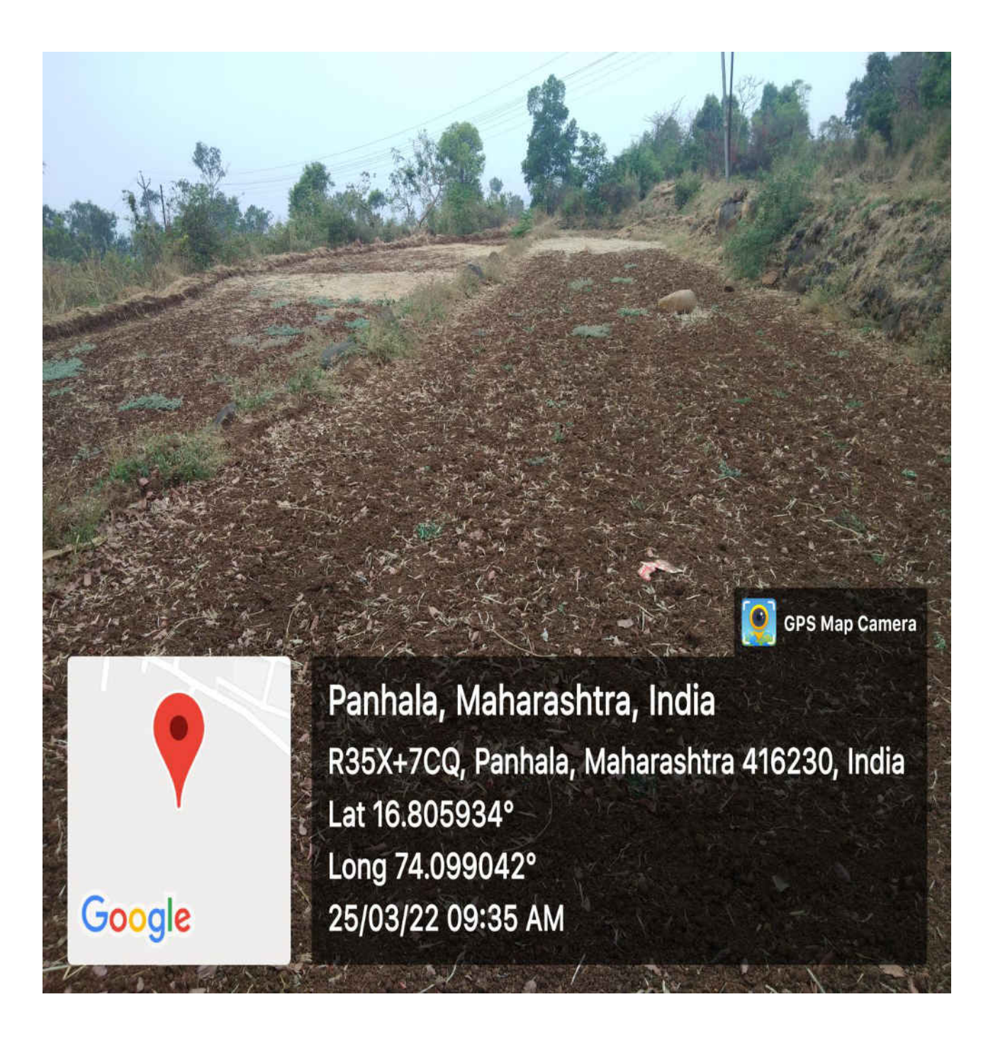
Photograph – Waste water conveyed to horse feed farm