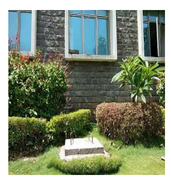
Rainwater harvesting pipe chamber