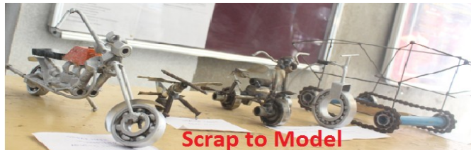
Scrap to Model