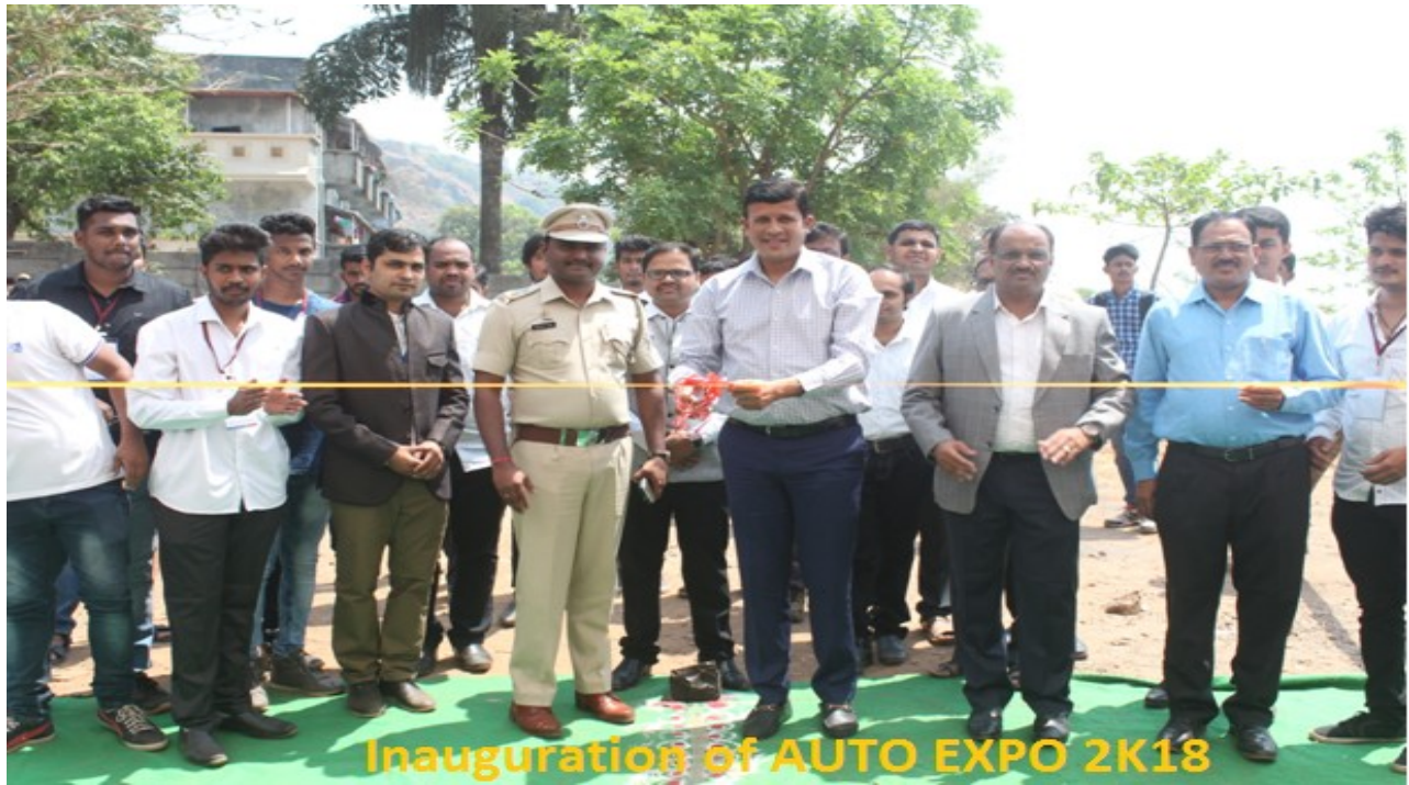
Inauguration of AUTO EXPO 2K18